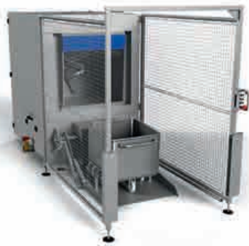
▶ Norm bin washer ENW-20 washes up to 20 standard carts per hour