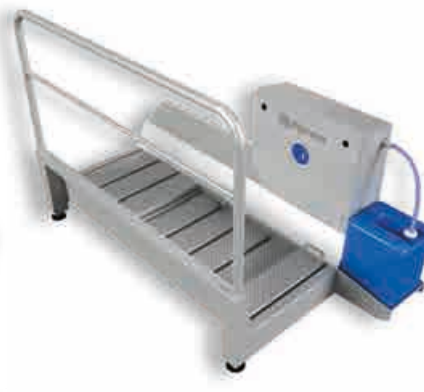
▶ DZD sole disinfection