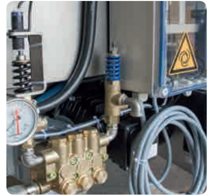
WMRA ▶ close-up of interior