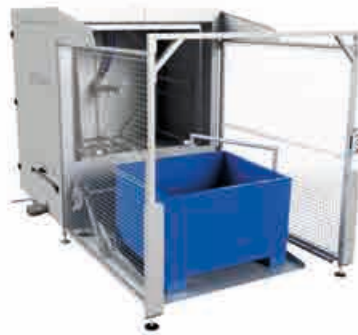
▶ Crate washer EDW-20 washes up to 20 crates per hour