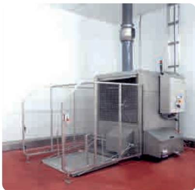
◀ EDW-20 wash 20 bins per hour