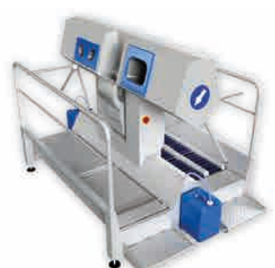
▶ SANICARE-DYSON-COMBI-BD sole cleaning and disinfection, hand washing, drying and disinfection with access control