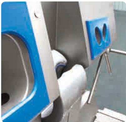
◀ SANICARE-DYSON-COMBI the all-in-one solution