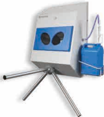
▶ HDT-WM chemical dispenser with access control