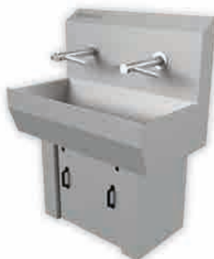
▶ Wash basin EWG-2S-TAP with sensor operation and integrated hand dryer