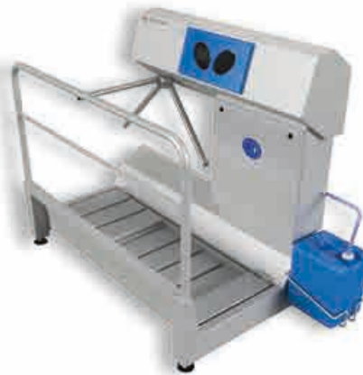
▶ DZD-HDT sole disinfection, hand disinfection and access control