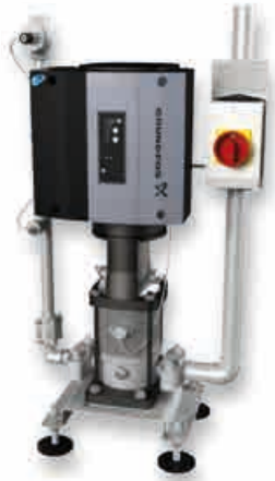
▶ Booster unit LDC-Q cleaning at 20 bar, up to 6 users