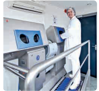
washing hands with the ▶ SANICARE-DYSON-B