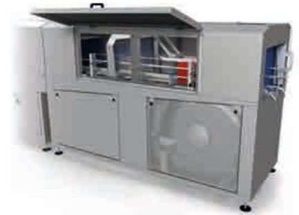
▶ Blower unit EAB-1-ST powerful fan blows away excess water