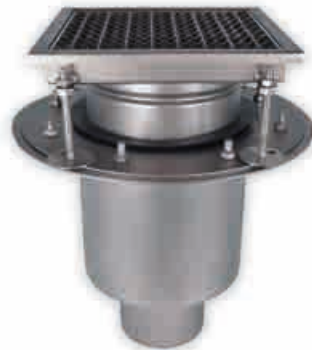
▶ Vertical drains two-piece with square top