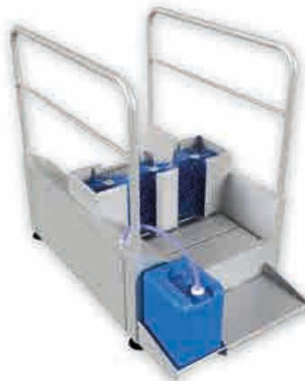
▶ EDSW shaft cleaning