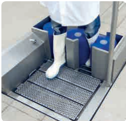
◀ Shaft cleaner EDSW built into the floor

Sole and shoe side cleaner ▶ floor model