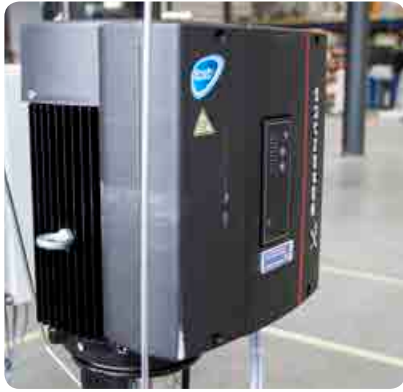
◀ LDC-Q pump