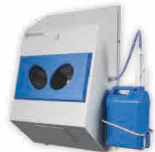
▶ HD-WM chemical dispenser