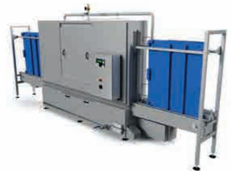
▶ Pallet washer EPW-45 for the washing and rinsing of pallets