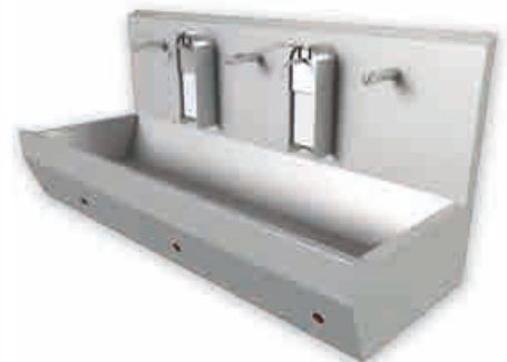
▶ Wash basin EWG-3 with optional soap dispensers