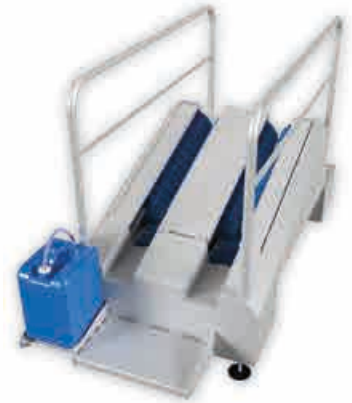
▶ DZSW sole and shaft cleaning