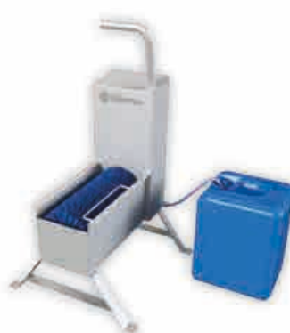
▶ EZW sole cleaning