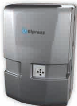
▶ Foam unit or disinfection unit CD/CF-Q for a centralised supply of foam or disinfectant