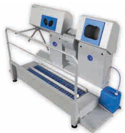
▶ SANICARE-DYSON-B sole cleaning, hand washing, drying and disinfecting with access control