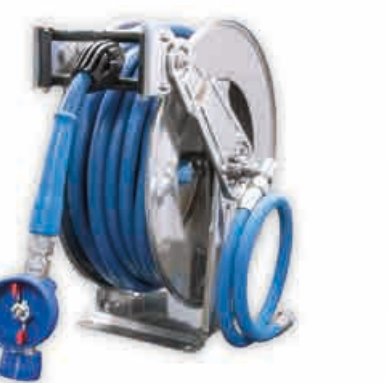
▶ Hose reel sets