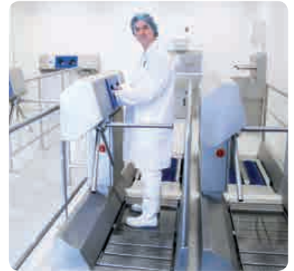
DZD-HDT ▶ built into the floor