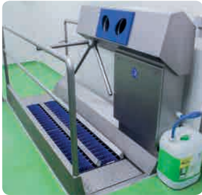
◀ DZW-HDT built into the floor