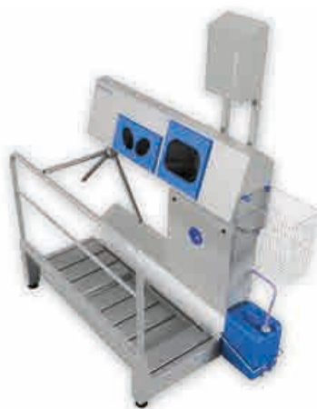
▶ SANICARE-D sole disinfection, hand washing, hand disinfection and access control