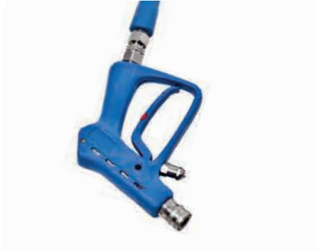
▶ Spray guns

expert advice, wide selection and fast delivery times