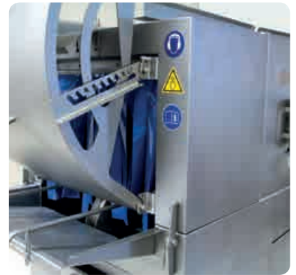
EKW-1500 ▶ with optional one-person operation