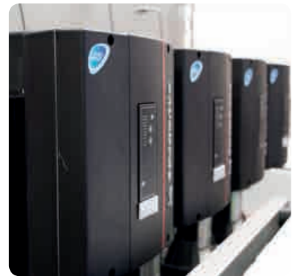
LDC-Q ▶ close-up of 400/20 model