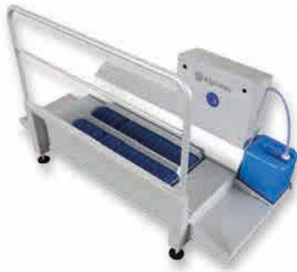
▶ DZW sole cleaning