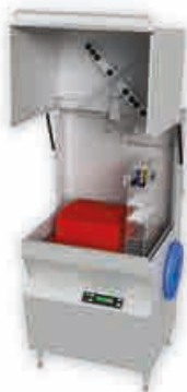
▶ Utensil washer ETW-10 for knife baskets, small crates and other utensils.