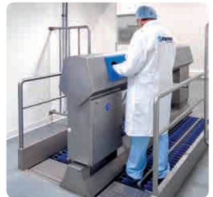
COMBI-BB-DD-1500 ▶ ideal for large throughput capacity