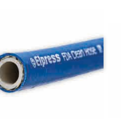
▶ Cleaning hoses