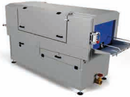
▶ Crate washer EKW-2500 washes up to 400 crates per hour