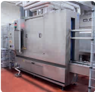
◀ EPW-45 with automatic feed and removal