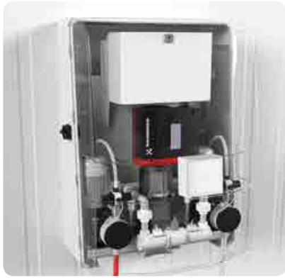
◀ CFD-Q provides users with a metered amount of foam and disinfectant