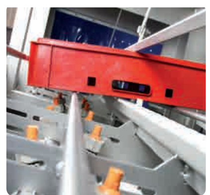
EKW ▶ inside