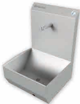
▶ Wash basin EWG-1 with sensor or knee operation