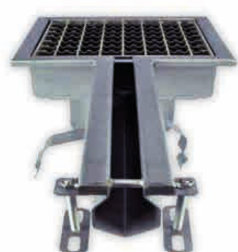
▶ Slotted drains available in various sizes