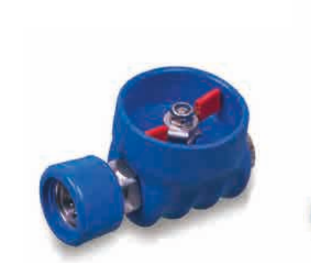
▶ Ball valves