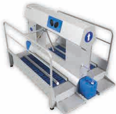
▶ COMBI-BB-DD-1500 sole cleaning, hand disinfection and access control for large throughput capacity