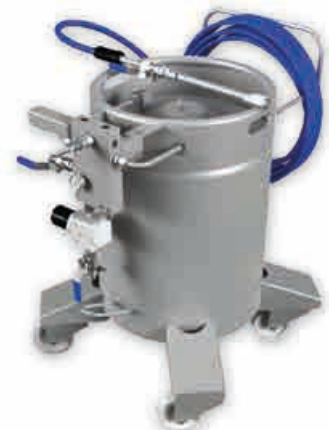
▶ Mobile foam tank S50-B mobile foaming, simple manoeuvring