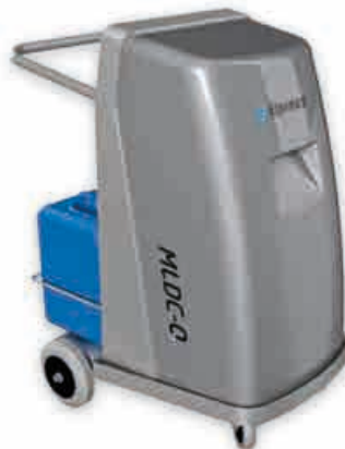
▶ MLDC-Q mobile booster unit