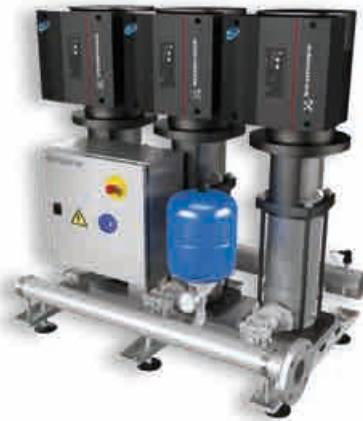
▶ Booster unit LDC-Q cleaning at 20 bar, from 8 users