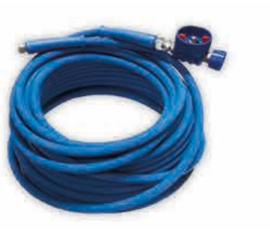
▶ Hose sets