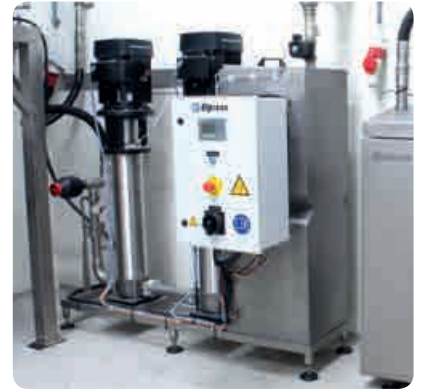
MDC 40-40 ▶ cleaning at 40 bar