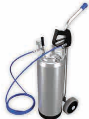
▶ Mobile disinfection tank MF-20 mobile disinfecting, simple manoeuvring