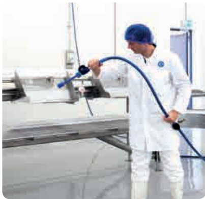
◀ Cleaning in combination with LDC-Q, satellite and reel set