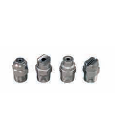
▶ Nozzles and spray heads