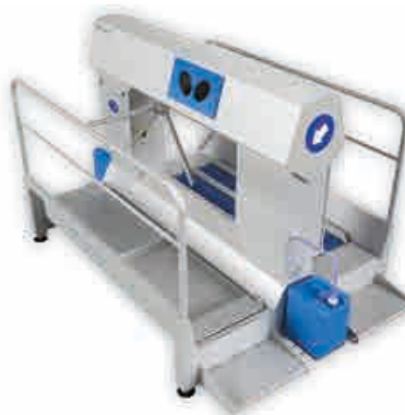
▶ COMBI-BD-DD-1500 sole cleaning and disinfection, hand disinfection and access control