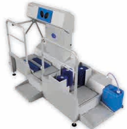
▶ DZW-HDT-EDSW sole cleaning, hand disinfection, access control and shaft cleaning