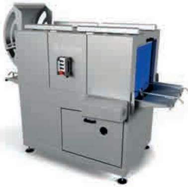
▶ Crate washer EKW-1500 the space-saving solution

modular structure for a wide range of uses