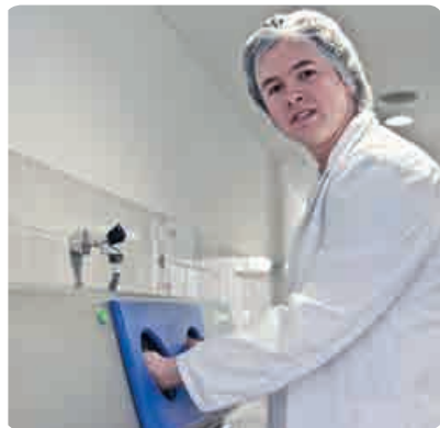
◀ HDT chemical dispenser with access control

Wash basin EWG-4S-D ▶ with optional soap dispenser