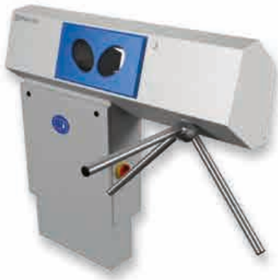
▶ HDT chemical dispenser with access control