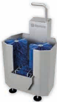
▶ EZSW sole and shaft cleaning