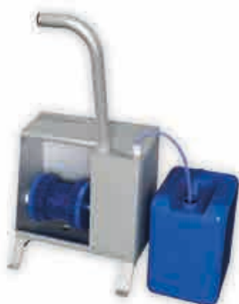
▶ EZR sole and shoe edge cleaner