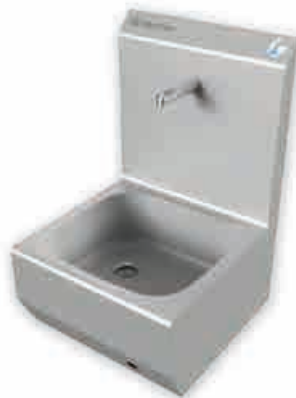
▶ Wash basin EWG-1-Deluxe with sensor or knee operation