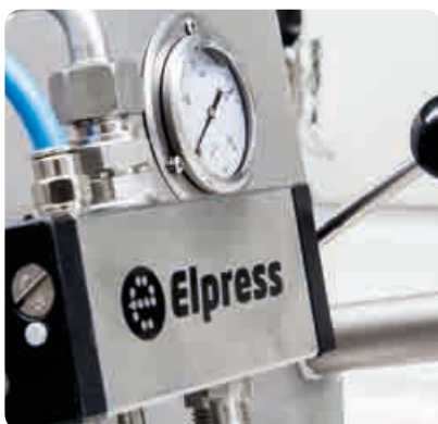
◀ MLDC-Q with Blocksat satellite