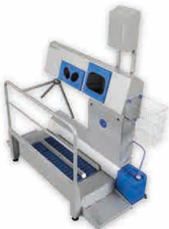
▶ SANICARE-B sole cleaning, hand washing, hand disinfection and access control