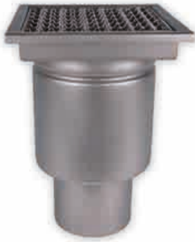
▶ Vertical drains one-piece with square top