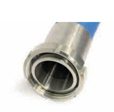
▶ Food grade hoses