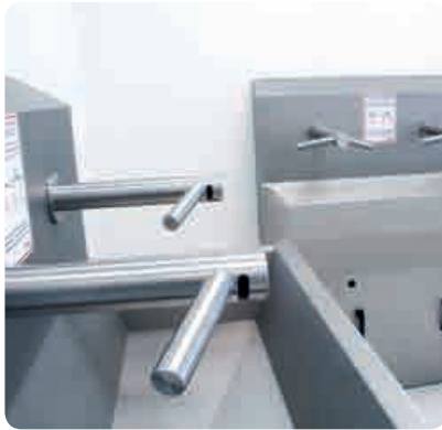
◀ EWG-2S-TAP washing and drying hands