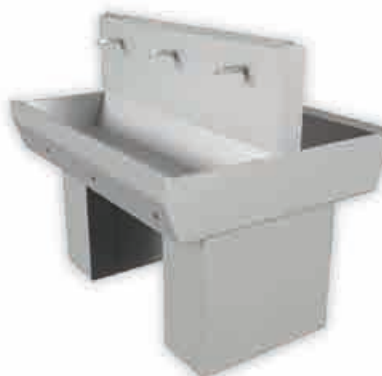
▶ Double wash basin EWG-3-D with sensor or knee operation