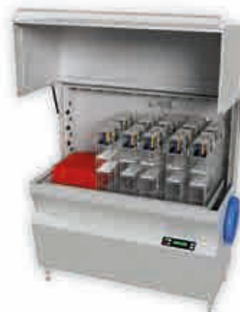
▶ Utensil washer ETW-30 for knife baskets, small crates and other utensils.