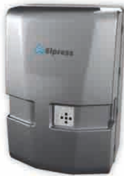
▶ Foam unit or disinfection unit CFD-Q for a centralised supply of foam or disinfectant