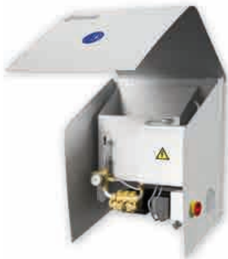
▶ Booster unit WMRA cleaning at 80 bar, for 1 user