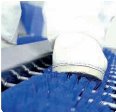
◀ Sole cleaner DZW 4-year warranty on brushes