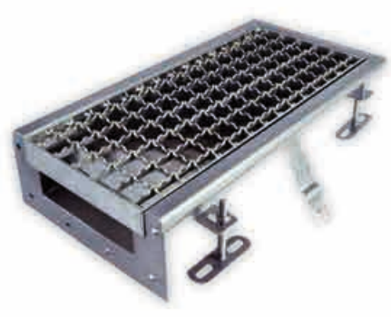
▶ Grid drains available in various sizes