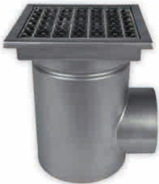
▶ Horizontal drains one-piece with square top