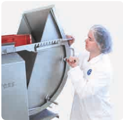
◀ EKW-2500 optional one-person operation