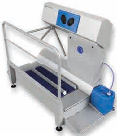
▶ DZW-HDT sole cleaning, hand disinfection and access control