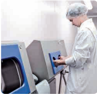
◀ disinfecting hands with the SANICARE-DYSON-B