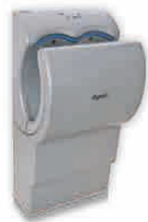
▶ Dyson Airblade™ in the colours grey and white