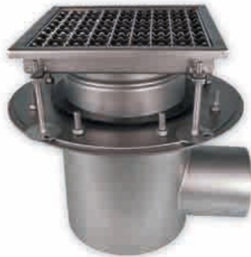
▶ Horizontal drains two-piece with square top