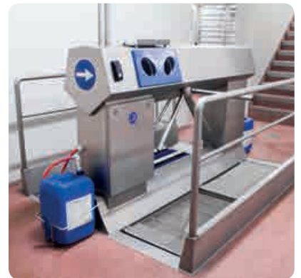
COMBI-BD-D-1500-L ▶ built-in model with optional time registration and document holder