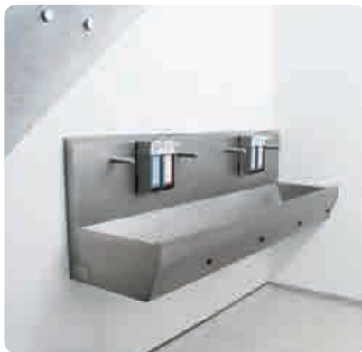
◀ Wash basin EWG-4S with optional soap dispensers

HDT-WM ▶ chemical dispenser with access control