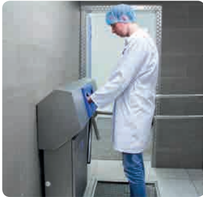
◀ HDT chemical dispenser with access control

Wash basin EWG-2S ▶ with optional soap dispensers and Dyson Airblade™