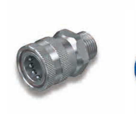
▶ Quick couplings, nipples, etc.