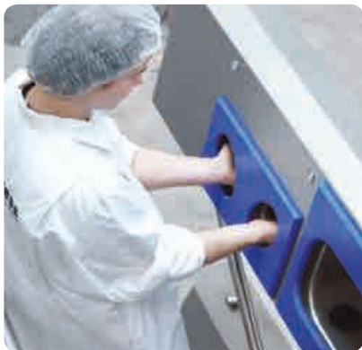
◀ disinfecting hands with the SANICARE-B