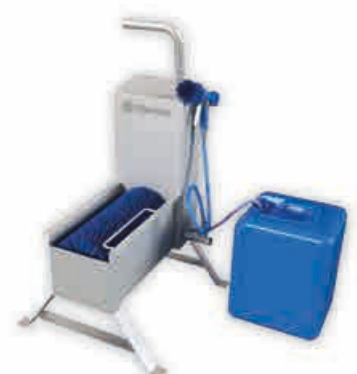
▶ ELZW sole and manual shaft cleaning