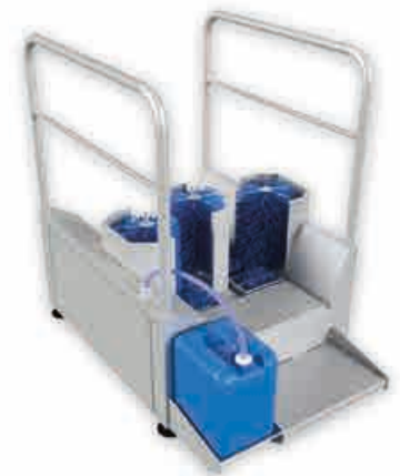
▶ EDLW sole and shaft cleaning