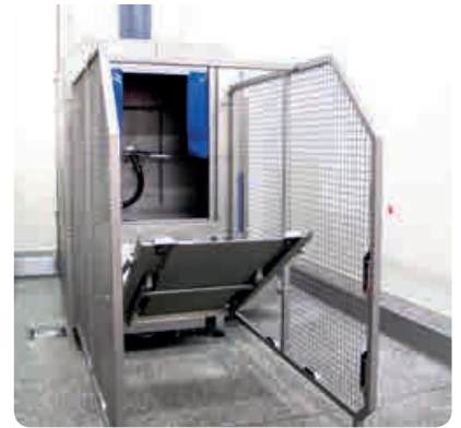
ENW-20 Plus ▶ wash 20 standard carts per hour