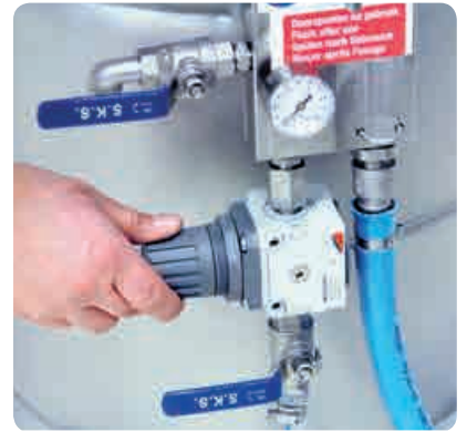
S50-B ▶ foam dosing easy to set