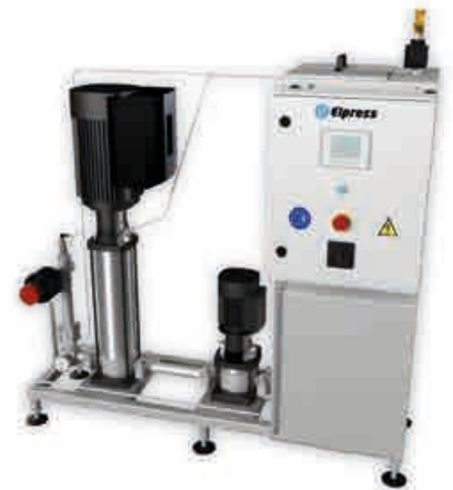
▶ Booster unit MDC cleaning at 40 bar, up to 16 users