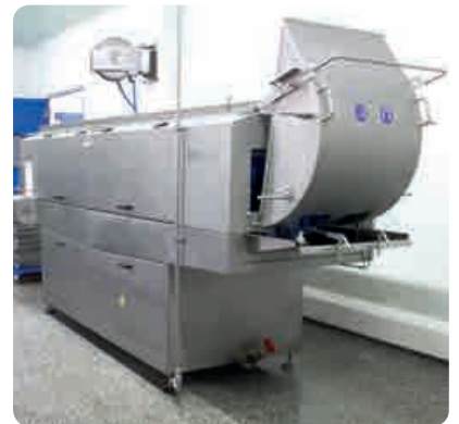
EKW-3500 ▶ with optional one-person operation