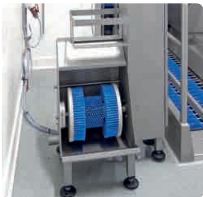
◀ Sole and shoe side cleaner EZR standing floor